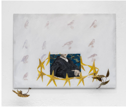
Isaac Willis Birds of Prey , 2024 Oil on aluminium Copper, brass and silver solder mounting 56 x 45 cm (IW08)