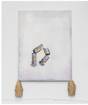
Isaac Willis Together Forever, 2024 Oil on aluminium, limewood 53 x 48 x 4 cm (IW01)