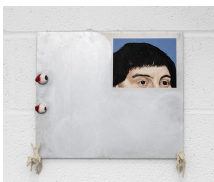
Isaac Willis Skewed, 2024 Oil, epoxy putty on aluminium 39 x 45 cm (IW06)