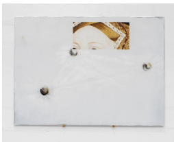
Isaac Willis Volume , 2024 Oil on aluminium Copper, brass and silver solder mounting 56 x 45 cm (IW09)