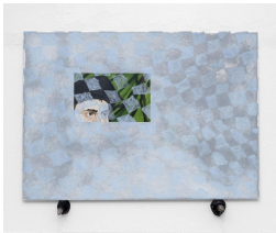
Isaac Willis Domain, 2024 Oil on aluminium, acid etch primer. Epoxy putty, oak gall ink. 56 x 45 cm (IW03)