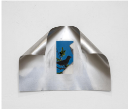
Isaac Willis Betwixt , 2024 Oil on aluminium 56 x 40 cm (IW07)