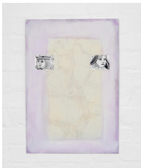
Isaac Willis Inevitable Collapse, 2024 Oil, gesso, silverpoint and oak gall ink on aluminium 40 x 26 cm (IW04)