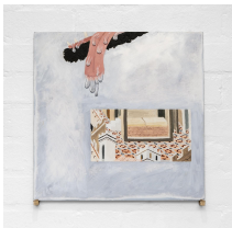
Isaac Willis Property, 2024 Oil on aluminium, epoxy putty, bronze 39 x 40 cm (IW05)